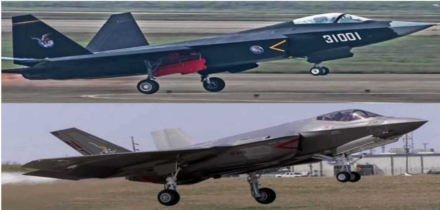
US's F35 and China's J31